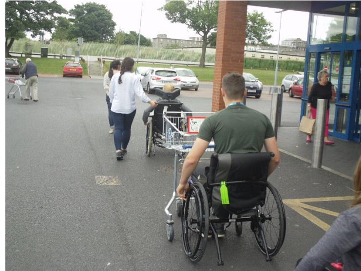
Figure 2: Wheelchairs and Seating