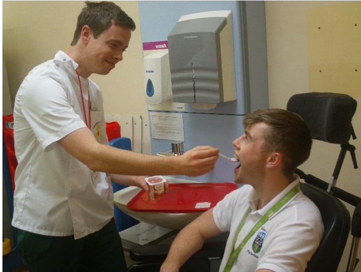
Figure 1: Safer Mealtimes (Simulation of eating in different position)