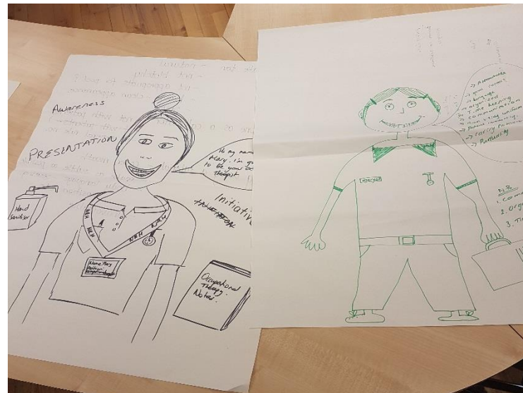
Figure 4: Professionalism tutorial

Tutorials: Academic Year Oct 2017 to January 2018